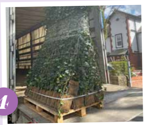
MATURE IVY PLANTS are delivered, to be planted behind the pergola and provide screening from neighbours.