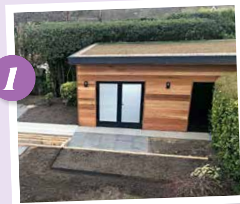
THE TURF IS STRIPPED , a drainage layer installed and the area levelled. Construction of the garden room is finished and paths laid.