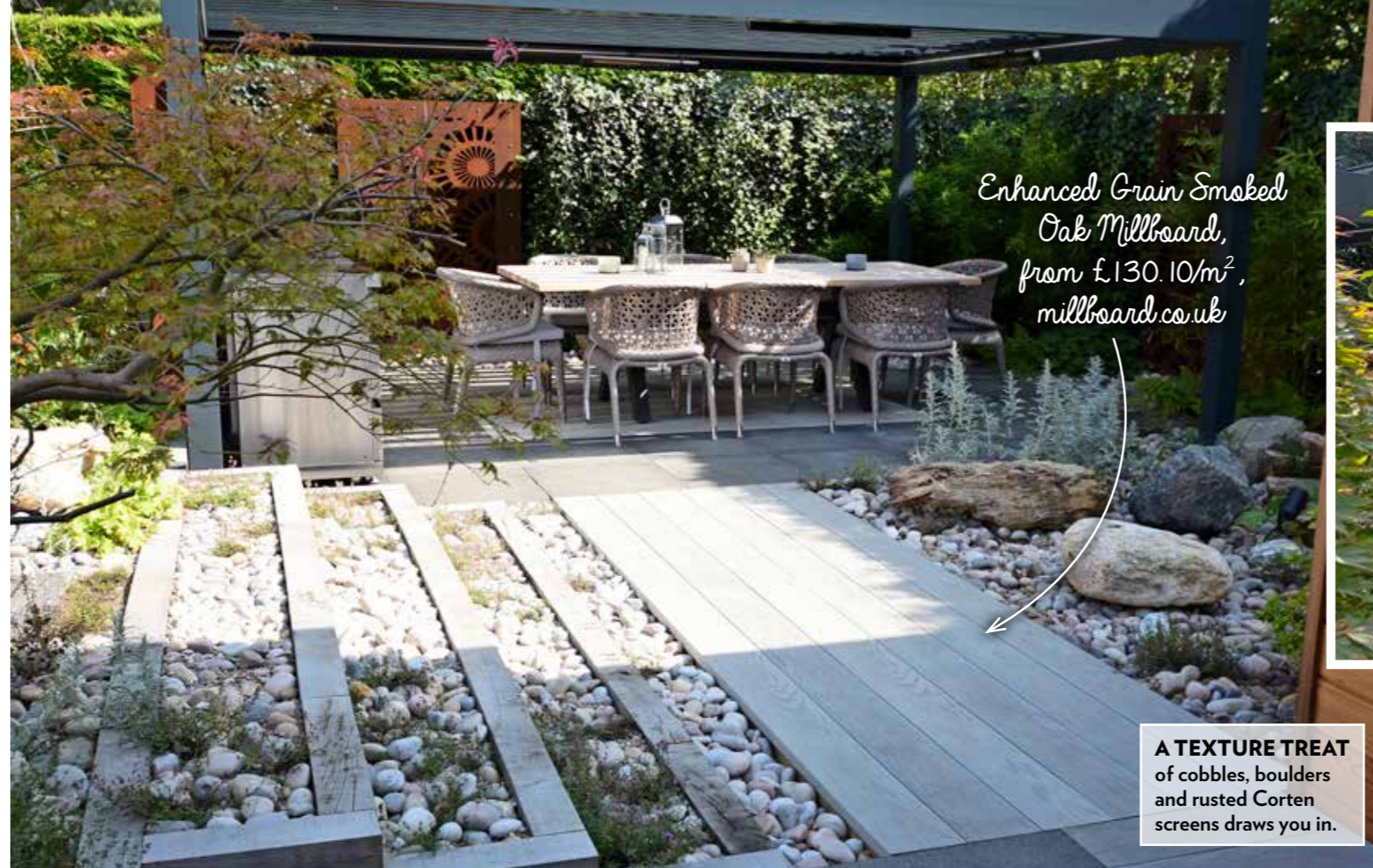
Enhanced Grain Smoked Oak Millboard, from £130.10/m 2 , millboard.co.uk

Clearance 1 week Groundwork prep, including installing electrical cables 2 weeks Installing paving, decking & pergola 2 weeks Soil works, cobbling & planting 1 week TOTAL: 6 weeks over 6 months