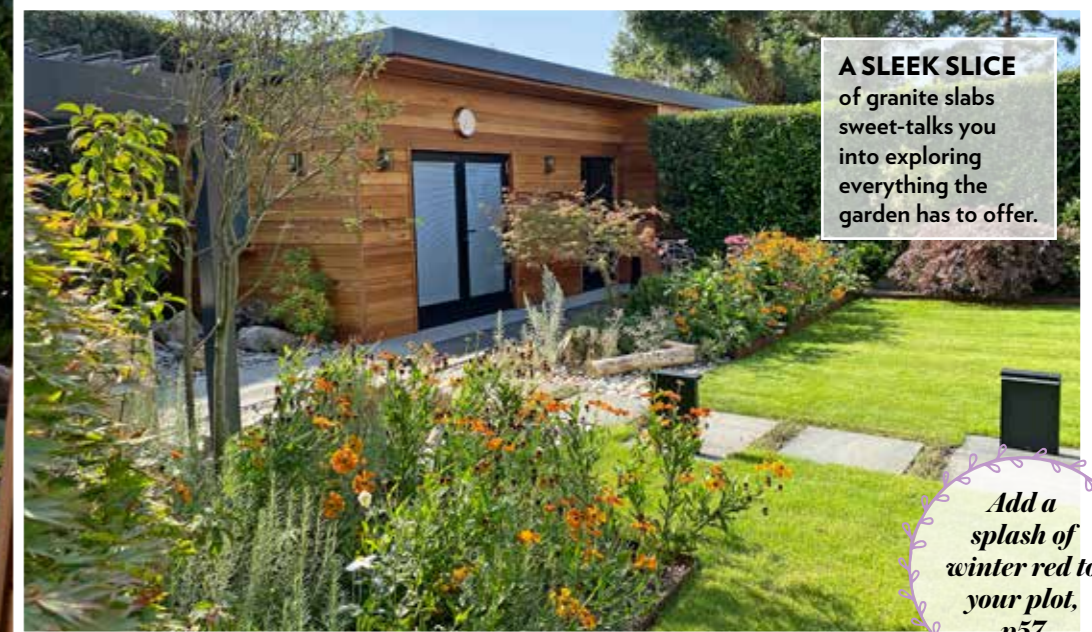
A SLEEK SLICE of granite slabs sweet-talks you into exploring everything the garden has to offer.