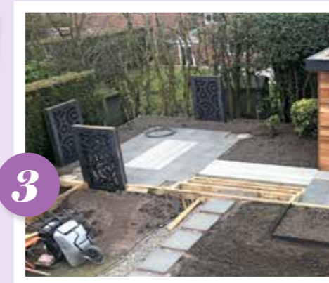
PAVING FOR THE KITCHEN and dining area is added. With the Corten screens already in place, the framework for the steps is built.