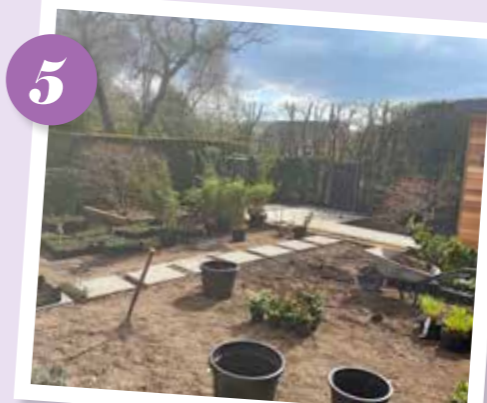
THE PLANTING BEGINS . The trees are in, and the thyme between the pavers in progress, but there's lots still to do!