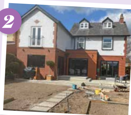
THE OLD SANDSTONE PAVING outside the back doors of the house is cleared and sleek Millboard decking laid in its place.