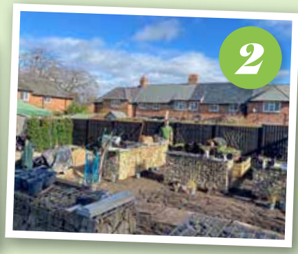
GO , GO , GABIONS! Painstakingly filled with stones by the landscapers, they form a screen in front of the allotment garden.