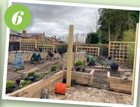
THE PLANTS are positioned ready for their new homes in the raised beds and the end is in sight for this garden glow-up.

36 MODERN GARDENS JUNE 2024 JUNE 2024 MODERN GARDENS 37