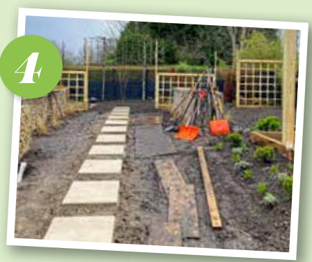
STEPPING STONES are laid in the centre of the garden, with pleached trees added for shade and screening.