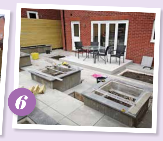
FINAL TOUCHES are made to the sunken beds and raised planters, then they're filled with compost ready to be planted.