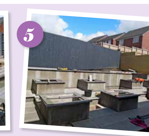
THE PLANTERS ARE RENDERED and topped with coping stones to provide extra seating. The side fence is clad in pine.

By late July, plants were being delivered on pallets from the Netherlands and from Crûg Farm in Wales (crug-farm.co.uk), and it was a daily job to keep them hydrated in the heat until